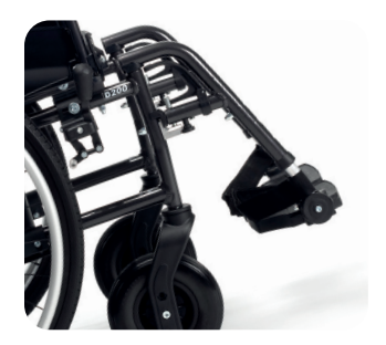
Removable swing-away leg rests (in and outwards)