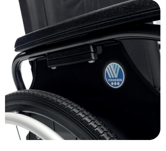
Armrests adjustable in height and depth to suit specific needs