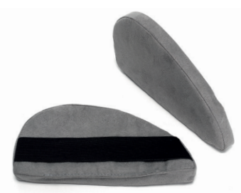
Hip cushion 2 cm - B28A Hip cushion 4 cm - B28B