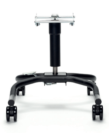
High-low indoor frame - U82