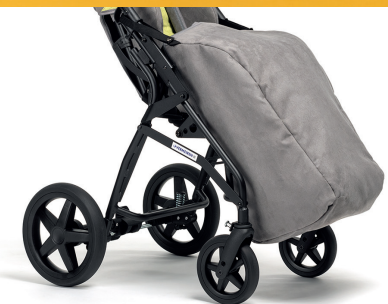
Legs cover - U62