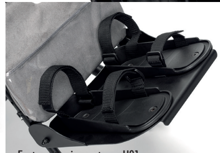
Feet postoning system - U91