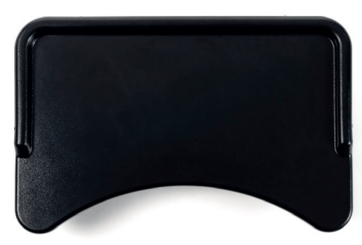
Plastic table - U90