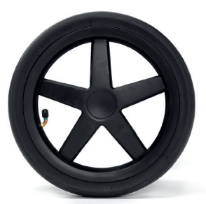
12" Inflatable/PU rear wheels