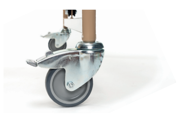
All 4 wheels can be locked for safety and security and allow for easy maneuvering.