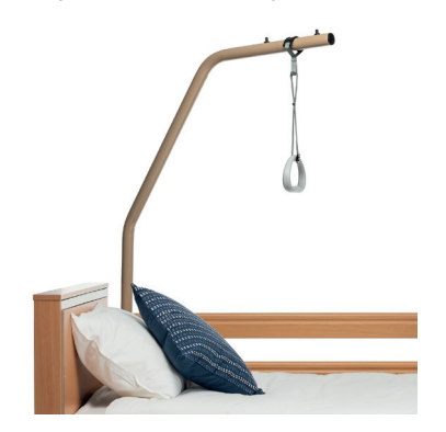
A monkey pole adds additional support to the independency of patients when lifting or repositioning themselves.

We've selected the best Club options for you. Discover all options here.