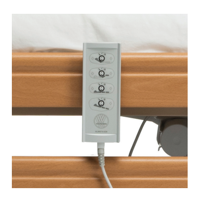
The controller is easy to use for both carer and user but can be locked if needed for additional safety.